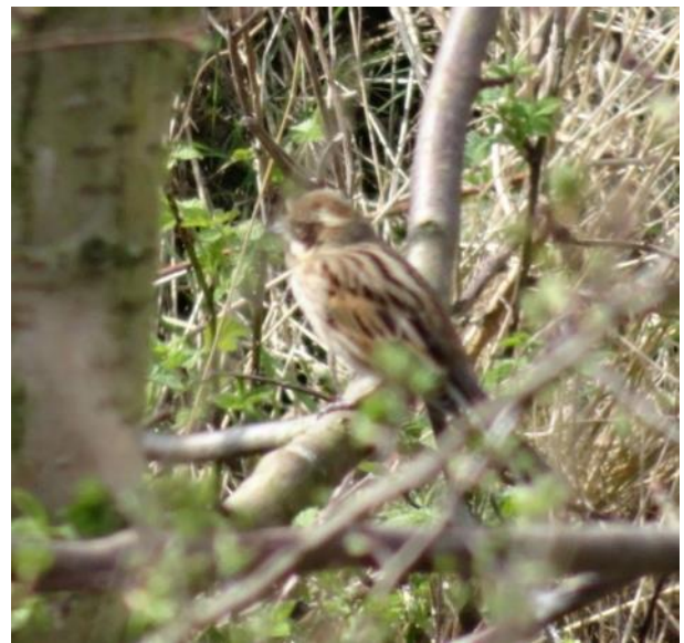
Female Reed Bunting