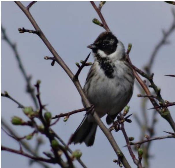
Male Reed Bunting