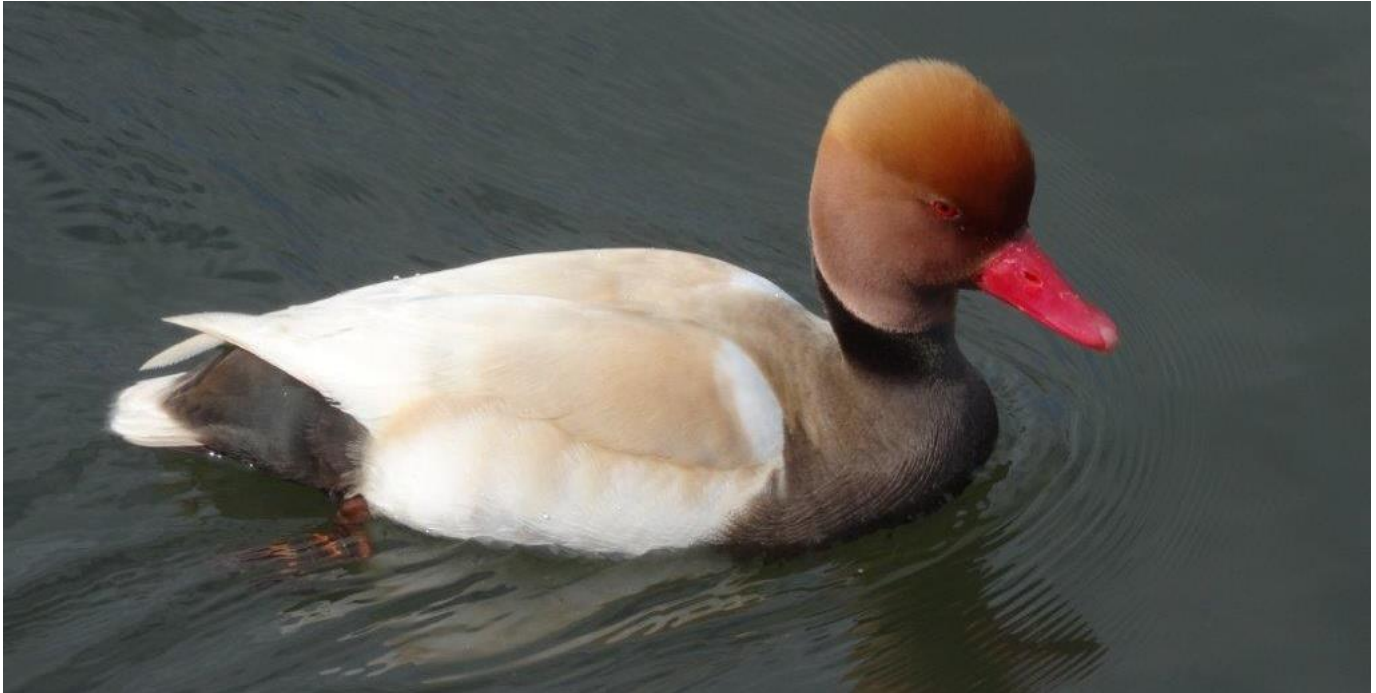
Red Crested Pochard

Lesser Whitethroat Cetti's Warbler Sedge Warbler Reed Warbler Chiff Chaff Bullfinch Linnet