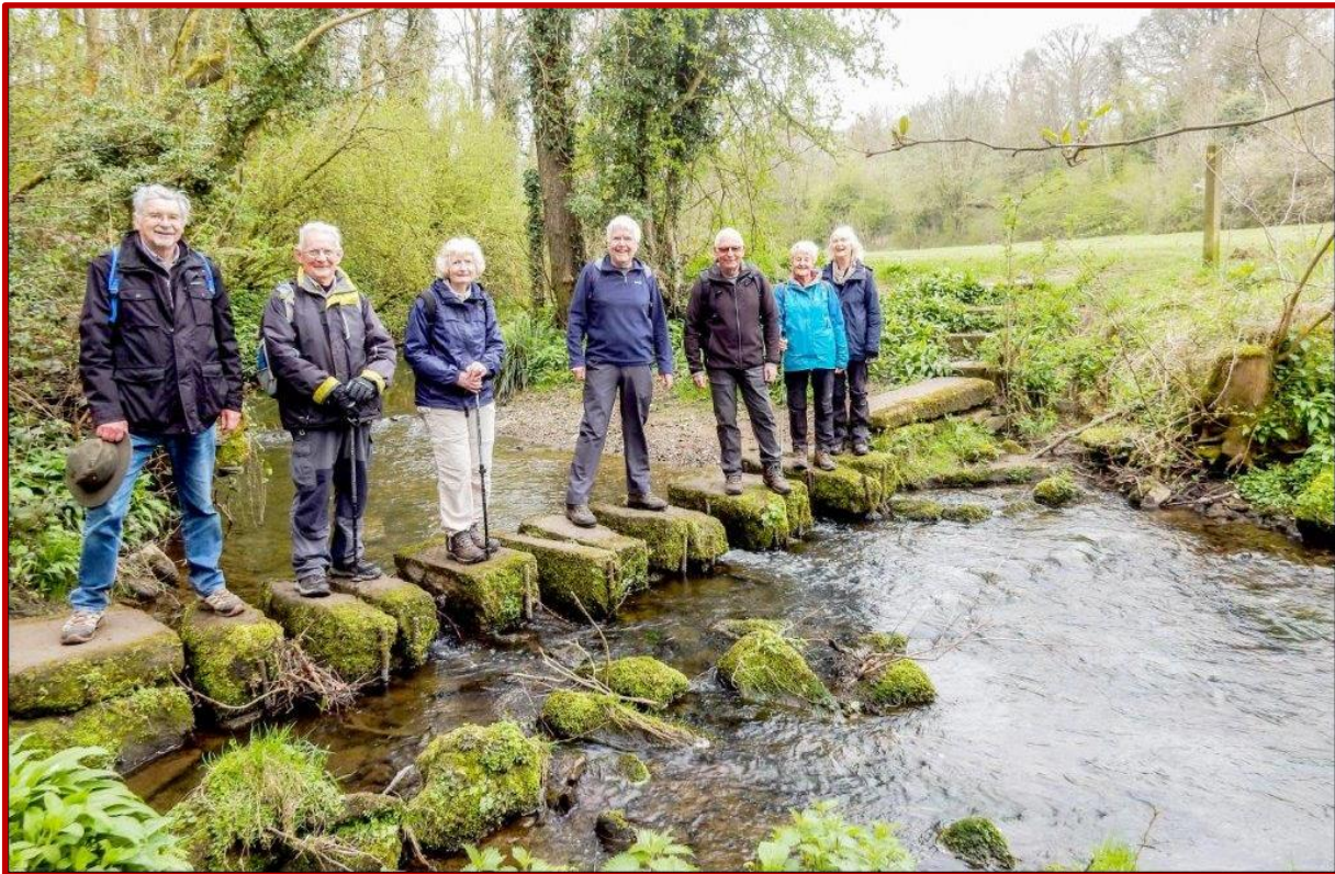
Crossing the River Amber at Ashover

8 Striders walked from Ashover along an old pony trail & then up a steep climb to Ravensnest. There were excellent views over the valley from a well positioned lunch stop & then a ridge walk before descending back to the start after crossing old lead mine workings. This was a varied walk with lots of interests too.